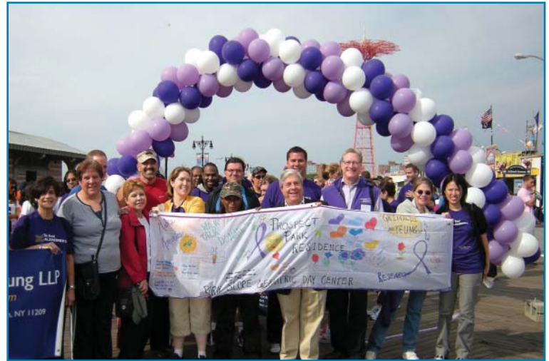
On September 23rd, NYMC staff and members teamed up with Grimaldi and Yeung, LLP, Elder Law firm for the Alzheimer's Association Walk to End Alzheimer's at Coney Island. The annual event benefits the fine work of the Alzheimer's Association, an integral partner that not only advances the importance of care, but the critical need to invest in further research.