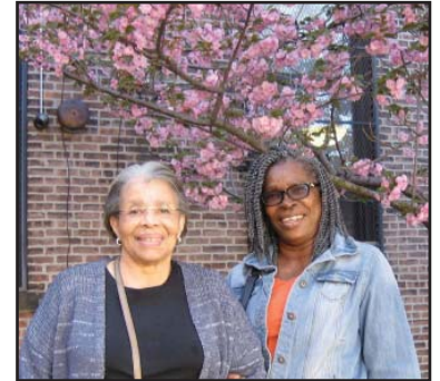
Each Spring cherry blossoms welcome members to our Park Slope Center.

Meeting the Needs of People Living with Alzheimer's & Dementia-Related Disorders