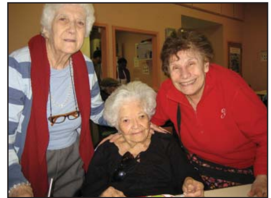
"I enjoy seeing my friends when I come to the center." —A Member

BUSHWICK 1143-45 DEKALB AVENUE BROOKLYN, NY 11221 718-484-2425